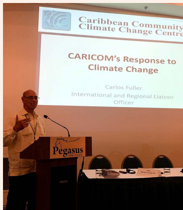
Regional scientific institutions like the Caribbean Community Climate Change Centre (CCCCC) were part of the dialogue.

The event demonstrated that the Caribbean is rich in complex ILK systems, and that there is interest by meteorologists and climate scientists to develop further understanding of those intellectual systems and improve cooperation with their holders. It highlighted the relevance that ILK approaches to food security, subsistence and economic innovations have for climate coping strategies, while shedding light on the gender aspects of how that knowledge is produced. Furthermore, it showed that there is potential for science – ILK cooperation on a range of important issues such as extreme weather events and slow onset changes (e.g. ocean warming and acidification), ecosystems-based adaptation, knowledge and management of aquatic weed infestation, invasive alien species, wildfires, flooding and storm surges. Important discussions were also held on the role of language in understanding and transmitting environmental information, as a contribution to the UN International Year of Indigenous Languages (IYIL 2019).