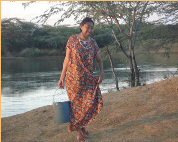
Wayüü woman collects rainwater from the jagüey, for consumption by the community's animals.

in decision-making from communities who hold the knowledge. Interactions between science and ILK systems do not always consider the rights of indigenous and local communities, and the benefits deriving from the research, as a central part of the collaboration. In some instances, the ILK is used by science for worthwhile purposes and the results of this collaboration are not shared back with the communities, or worse, are not used to improve their local conditions or to enable the development of appropriate policies that can improve their livelihoods and resilience. Participants explained that this perception of sciences leads to distrust, losing hope and unwillingness to cooperate among indigenous peoples and local communities.