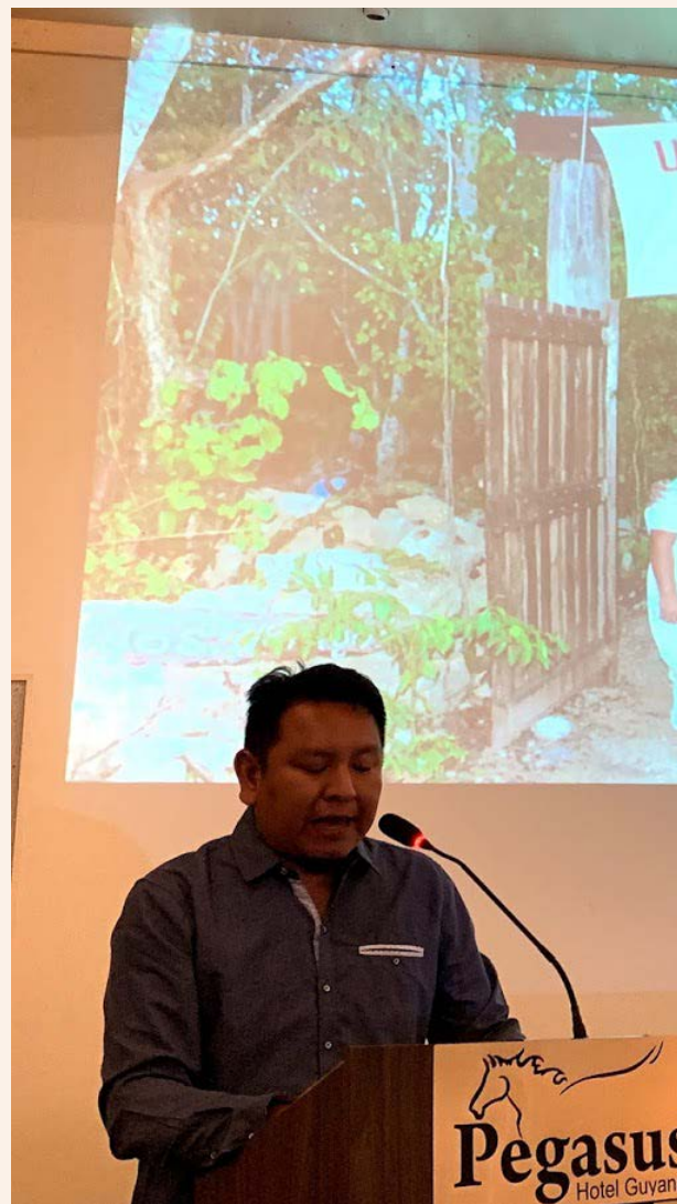
Presentations by indigenous peoples and local communities put forward common problems they face in the region.