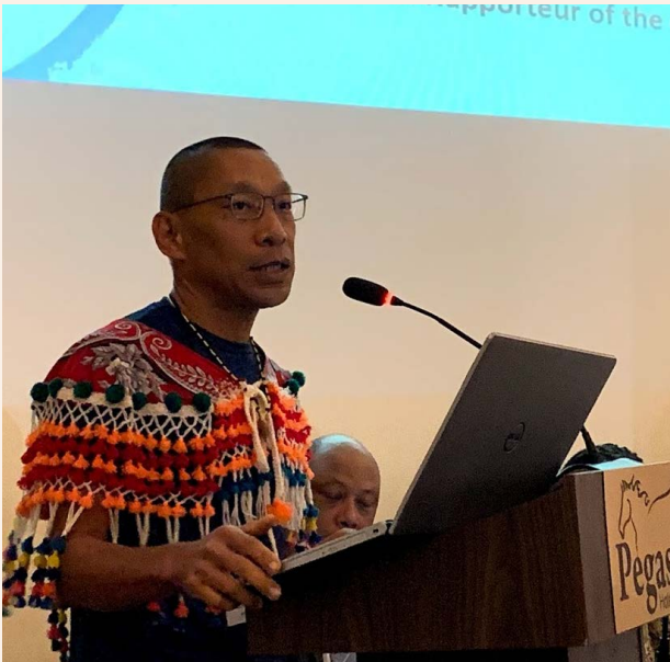
Indigenous peoples and local communities presented their recommendations during the Highlevel meeting.