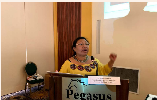
Indigenous women's knowledge was highlighted as a crucial element for food security.

Participants of the workshop discussed various methods being used to safeguard indigenous and local community knowledge systems, as well as challenges that have been experienced while undertaking those initiatives. In Colombia, there are initiatives to interview elders using recording techniques. The need to document and archive traditional agricultural systems was mentioned as a priority. In St Vincent and the Grenadines and St Lucia, community fishers worked with researchers using GIS technology to undertake local level environmental assessments.