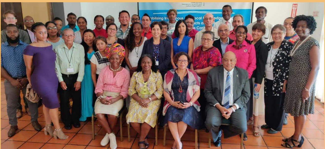
The workshop gathered 40 experts coming from 14 countries of the wider Caribbean region, including indigenous peoples and local communities' knowledge holders, government representatives, scientists, national and regional meteorological institutions.