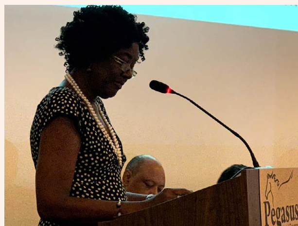
The workshop was organized together with the Guyana National Commission for UNESCO.

The Caribbean region knows much about the economic and environmental challenges posed by climate change. The region is unique in its cultural diversity, with layers of indigenous civilizations, European colonization, the heritage of slavery and liberation, and diverse migration from all parts of the globe. Together, the diverse geography and heritage of the islands have facilitated a flourishing of local cultures, knowledge systems which has allowed people to establish niches within the natural environment to achieve economic development. In the context of the current environmental crisis, the region is now faced with the challenge of navigating an unpredictable future while drawing on its cultural and natural resources, and most evidently, its intellectual capacity for problem solving and adaptation.