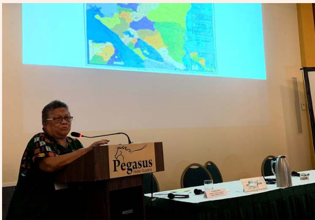
Regional initiatives on indigenous knowledge and adaptation are being implemented through the Fund for the Development of Indigenous Peoples of Latin America and the Caribbean (FILAC).

In Nicaragua, there are periodic disaster preparedness exercises in communities and schools, and traditional shelters are being used. Ancestral knowledge is still being used for reading or predicting the weather, although much less so in suburban areas. River flooding is fairly common in Suriname, but coastal regions nowadays see an increase in strong winds and tails of hurricanes. Based on the experience of recent years, the tribal Saamaka communities in Suriname know approximately how high the flood water will be in the coming year.