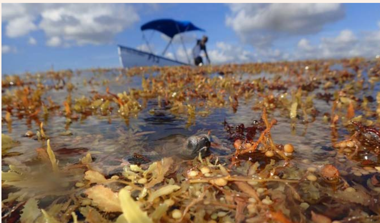
Turtle hatchling and boat in sargassum. © Amy Cox

The Case Study from Cuba is developed in some detail in the next box, as an example that showcases how the environmental knowledge of local communities living in small islands in the Caribbean is mobilized to adapt to weather and climate dynamics (see case study 1 in the next box).