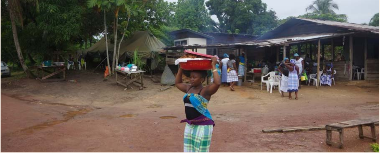
Women of the village Brownsweg (Suriname) preparing for a ritual.

The need to reflect on how development projects are articulated to traditional practices was raised by participants. In the La Guajira region of Colombia, mining was signaled to have great impact on community agriculture, medicinal plants and animals. Other threats to community-based farming have been less visible but certainly not less serious, such as the replacement of traditional crops by monocrop cultivations for the tourism industry or for animal fodder. These practices result in the degradation of the soil, pesticide pollution, environmental degradation and the loss of diversity and traditional knowledge, leading to changes in social patterns that are no longer based on families and economies of solidarity.