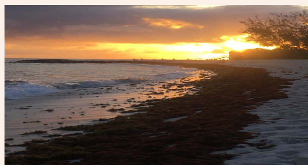
Sargassum along tideline at sunset.

supporting ecosystems like coral reefs, seagrass and mangroves. The importance of participatory community initiatives was highlighted by the experiences in Antigua, where wetlands that used to provide water and food, have in recent times become home to invasive species, rubbish and trash. In response, some community groups that are involved in tourism, and therefore depend on a healthy coastline, took initiatives to counter this, and they became important actors in co-managing the coastal areas after constructive dialogue with the government. The example shows that being able to have benefits from their active involvement, as well as the trust factor, is essential in small societies.